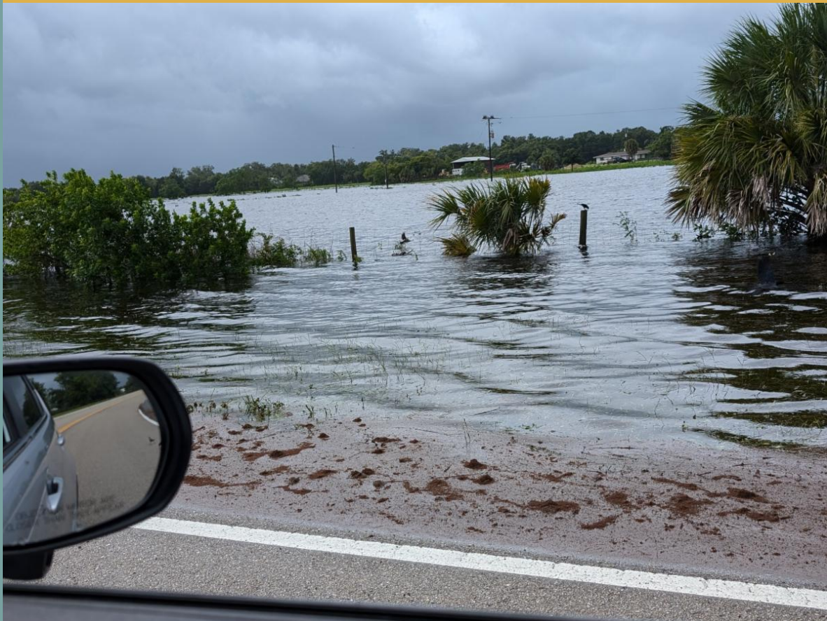
Above: Smith Farm, Raymond Road, the day after TS Debby

Smith Farms Rezone Nov. 21! 5:00 p.m. in Venice